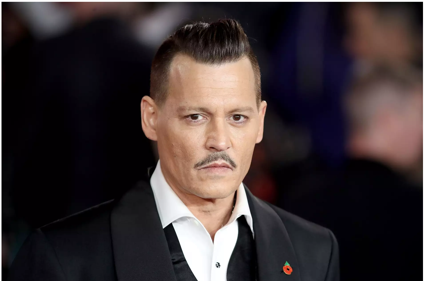
Johnny Depp attends the 'Murder On The Orient Express' World Premiere at Royal Albert Hall on November 2, 2017 in London, England.